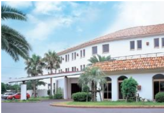
Chuo Gakuin University Seminar House of Tateyama