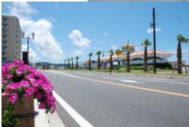
HOJO Beach Side