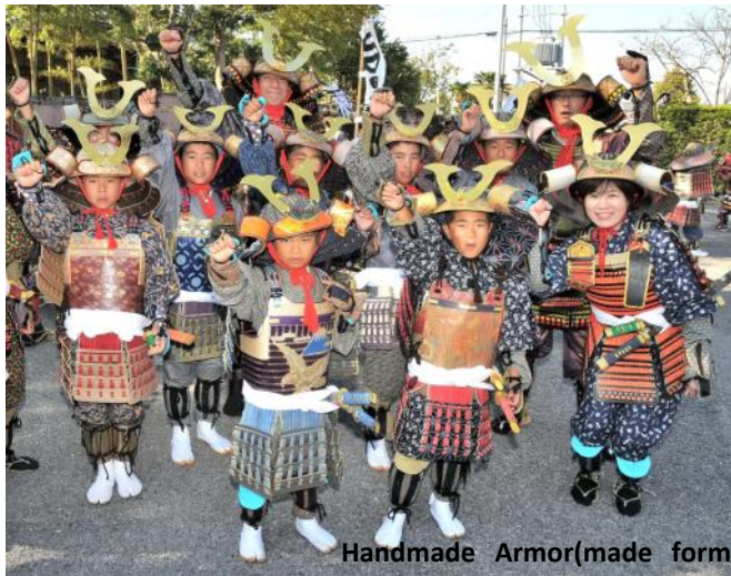
Handmade Armor(made from Cardboard)