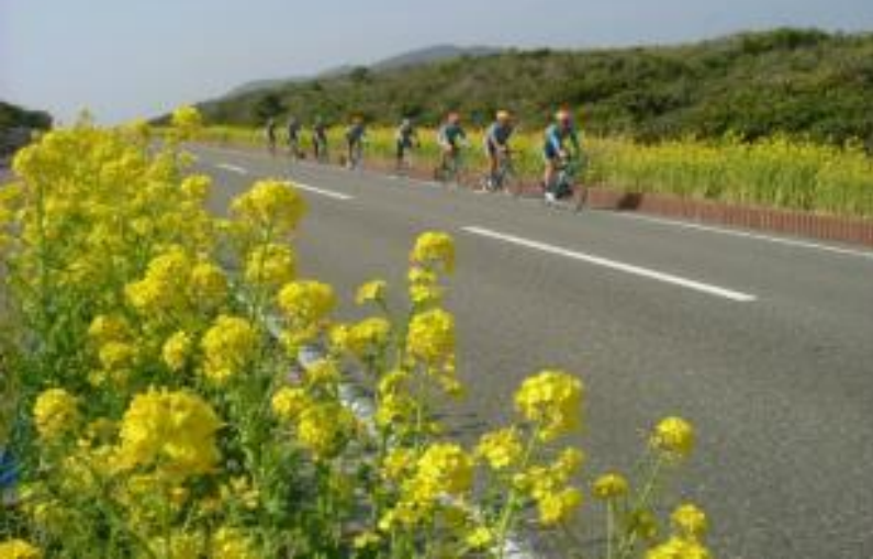
BOSO Flower Line