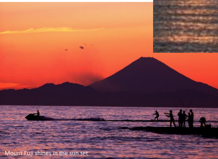
Mount Fuji shines in the sun set

Tateyama is where the shore faces the west. At the end of your day, enjoy relaxation time with the beautiful sun set.