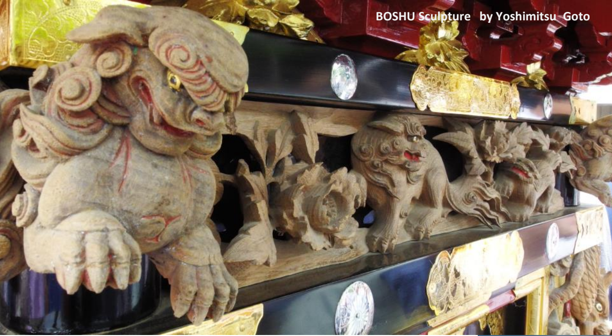
BOSHU Sculpture by Yoshimitsu Goto